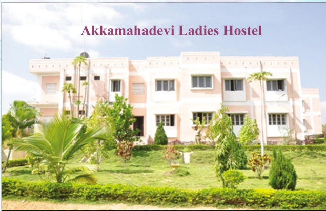
Akkamahadevi Ladies Hostel