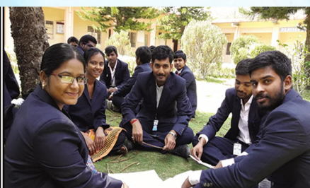
Learning in Groups