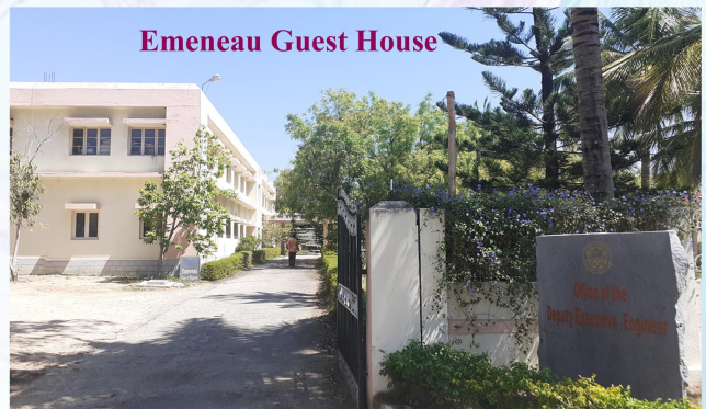
Emeneau Guest House