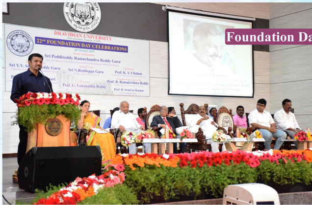
Foundation Day Celebrations - 2019