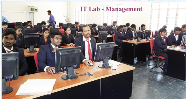
IT Lab - Management