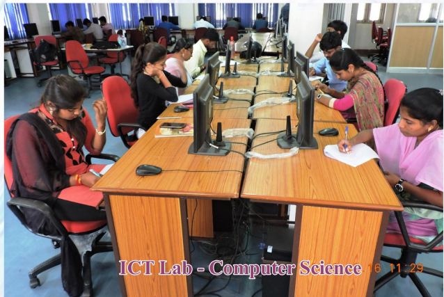
ICT Lab - Computer Science 16-11-29