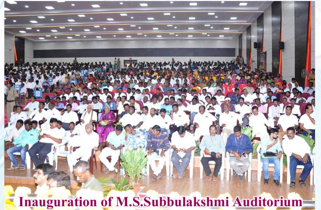
Inauguration of M.S. Subbulakshmi Auditorium