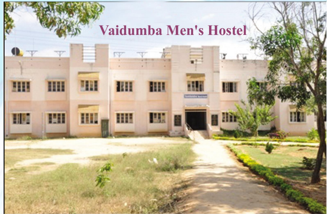
Vaidumba Men's Hostel