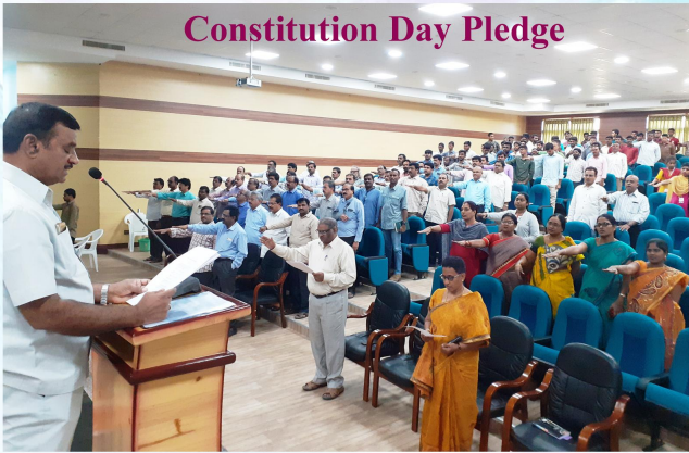
Constitution Day Pledge