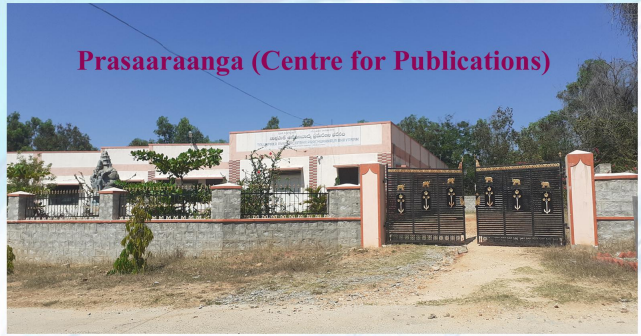
Prasaaraanga (Centre for Publications)