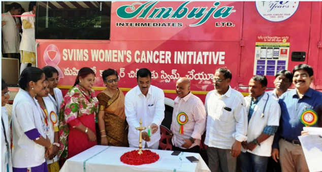
Ambuja INTERMEDIATES LTD. SVIMS WOMEN'S CANCER INITIATIVE మహిళా కేన్సర్ సిస్టమ్ పోయూ