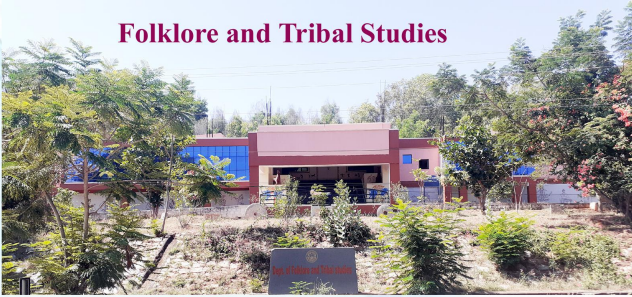
Folklore and Tribal Studies